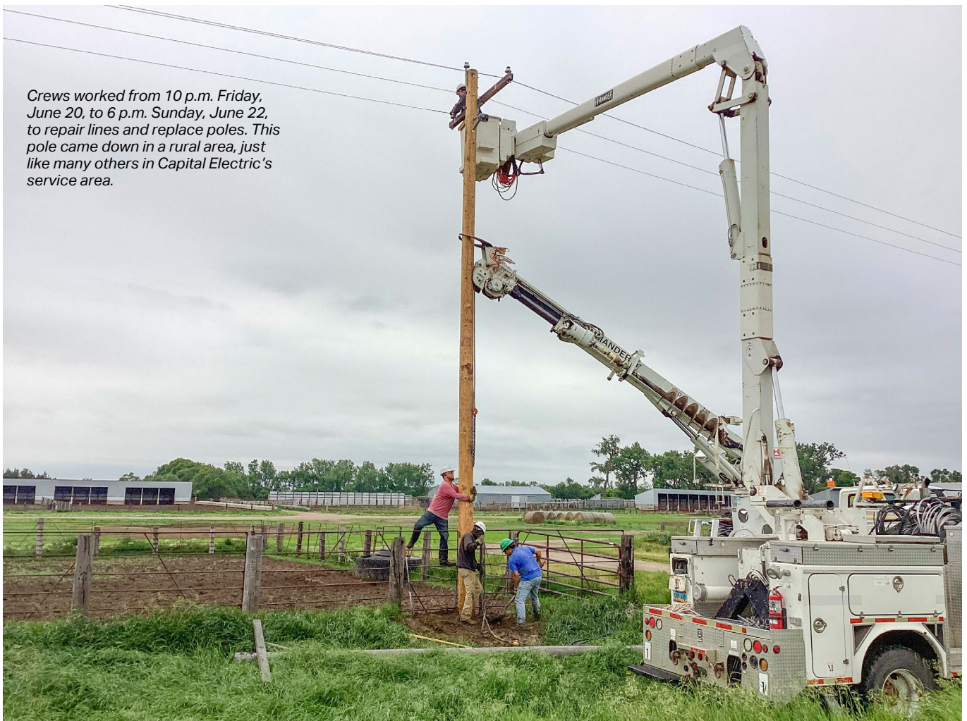
Crews worked from 10 p.m. Friday, June 20, to 6 p.m. Sunday, June 22, to repair lines and replace poles. This pole came down in a rural area, just like many others in Capital Electric's service area.