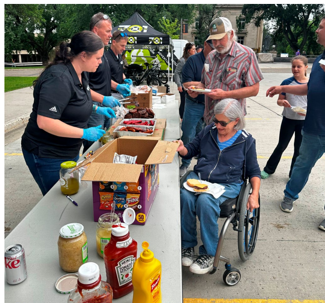
Those who attended this year's event were treated to burgers and hot dogs, which were grilled by the staff at Border States.

Bobcat, Bird, Border States, Schwan GMC, Dakota Supply Group, Eide Automotive Group, Irby, Lignite Energy Council, North Dakota Association of Rural Electric Cooperatives, Pro Kartz, Puklich Chevrolet, Subaru of Mandan and Wesco. ☎