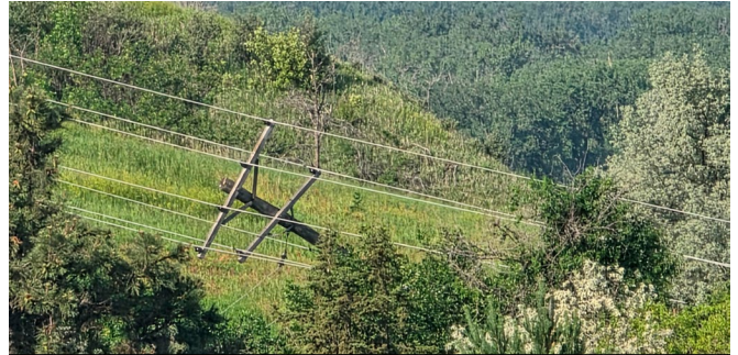
A string of poles marching up a wooded hill near the University of Maryland were taken out during the storm. Capital Electric's operations department worked out a method to restore power, but will be working on a more permanent solution soon.