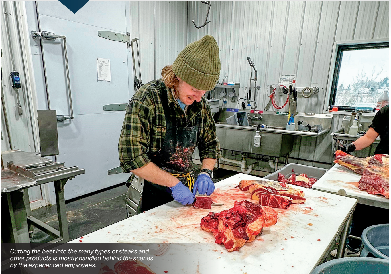
Cutting the beef into the many types of steaks and other products is mostly handled behind the scenes by the experienced employees.