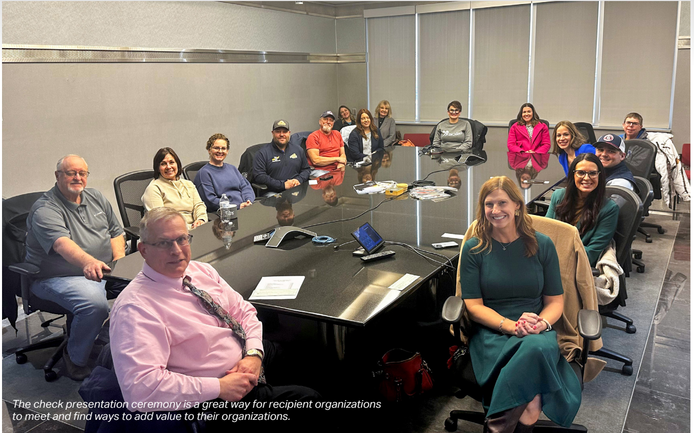
The check presentation ceremony is a great way for recipient organizations to meet and find ways to add value to their organizations.