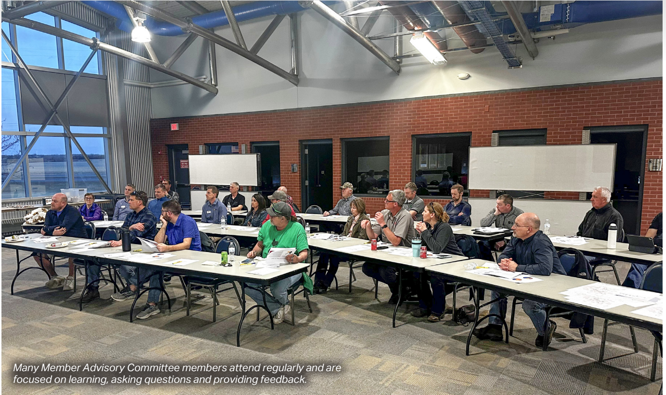
Many Member Advisory Committee members attend regularly and are focused on learning, asking questions and providing feedback.