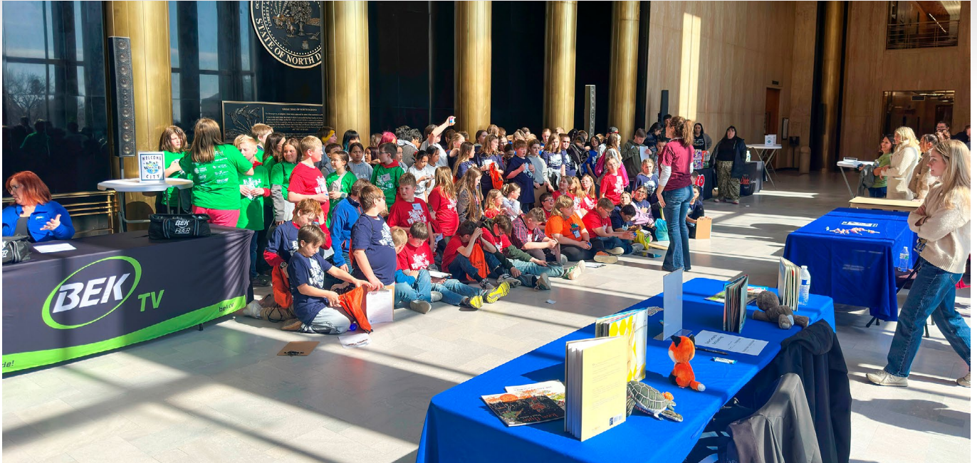
Students come together to learn about real life and make friends.