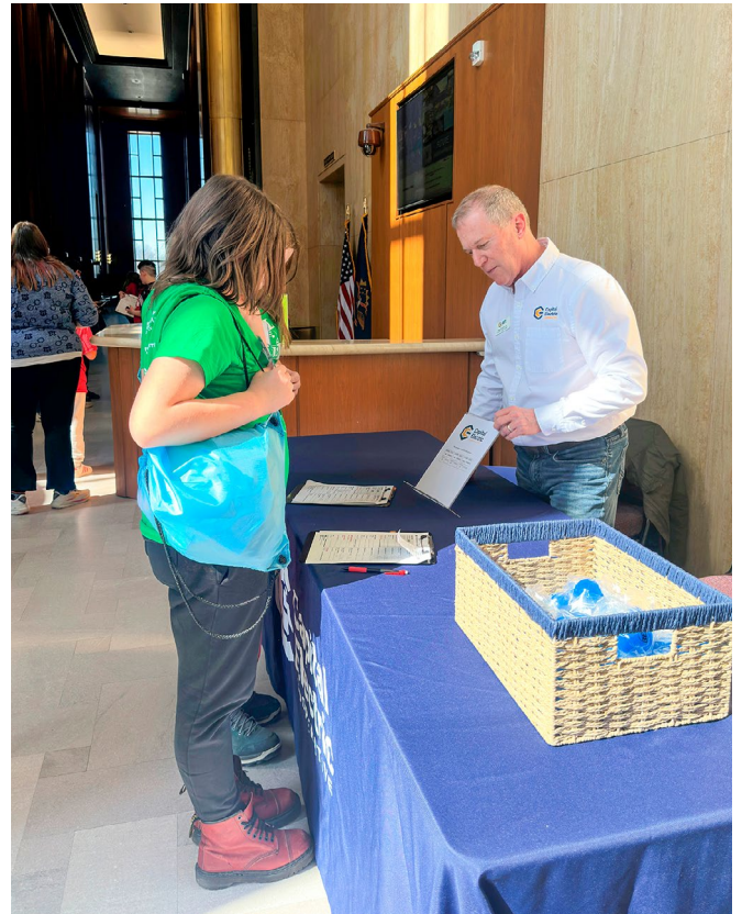
Preparing a budget makes life more manageable. After being assigned a job and a home, students realize what they can afford after paying for basic needs.

A group of volunteers help make the event run smoothly. The event is a positive community experience for children and Capital Electric Cooperative is privileged to be part of it. ☺