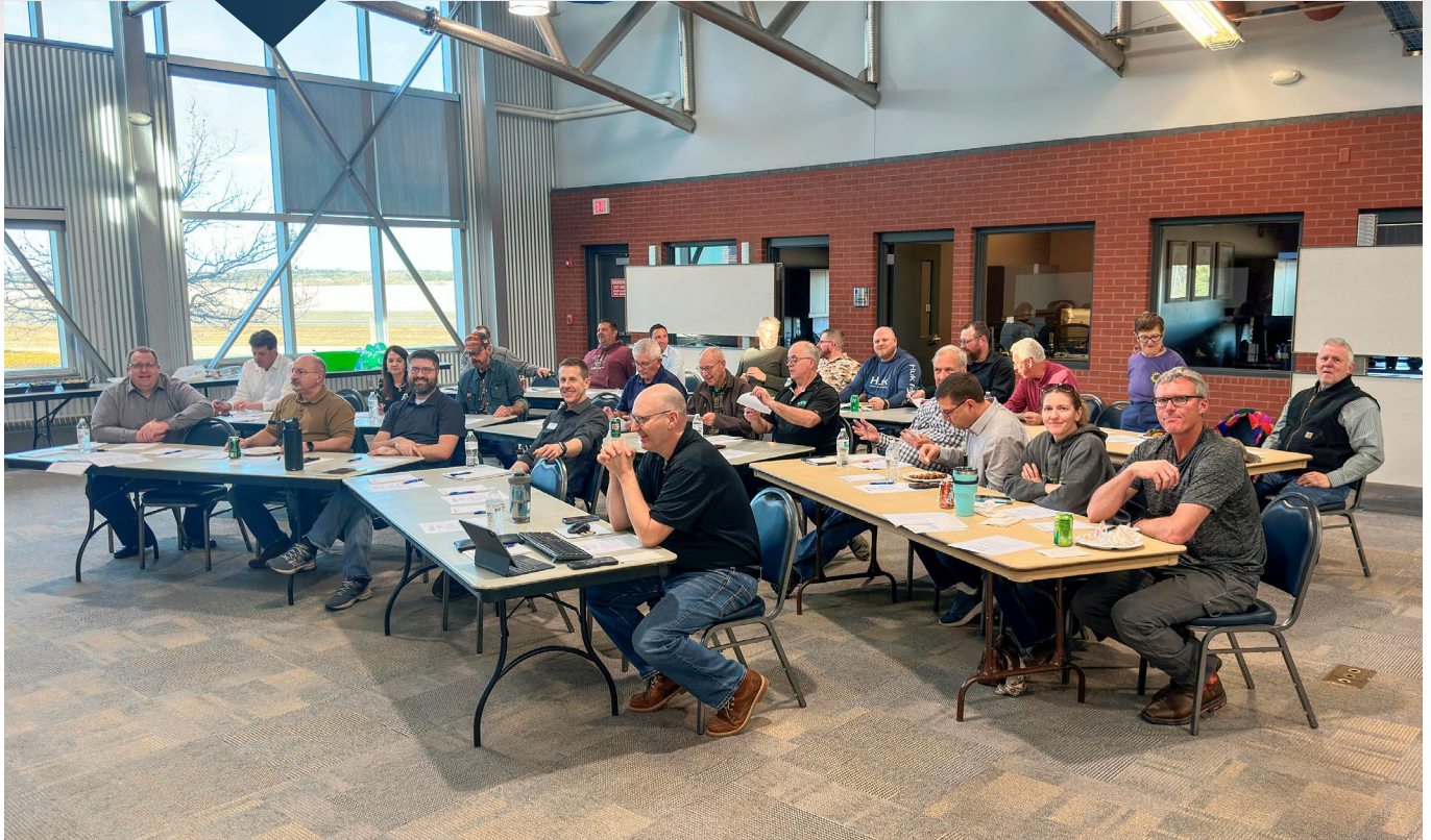
Another great meal, another informative meeting and collaboration to continue to put members' needs first were all part of the Member Advisory Committee meeting.