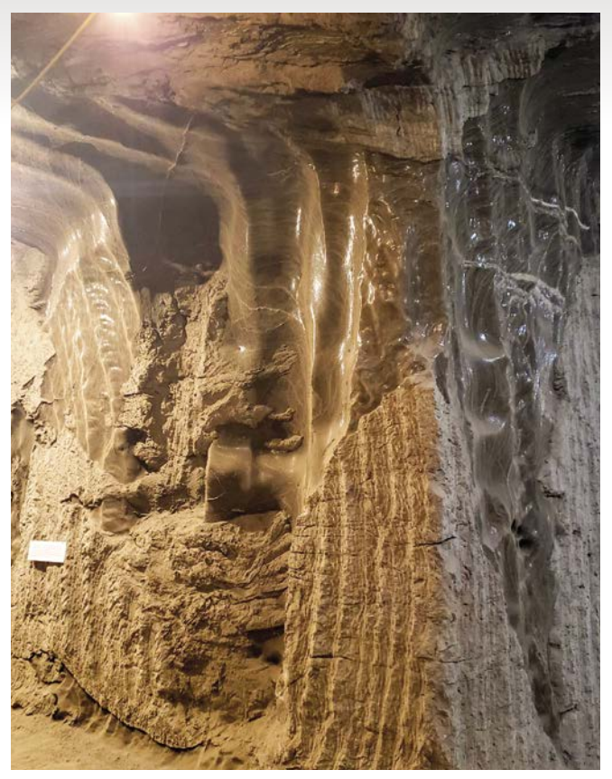
The ice wedges continue to decline through sublimation (transition of a substance directly from a solid to a gas) without melting.

"One design is able to do all of this, and it takes a fraction of the resources," Schaffner says. "We're going to be able to heat a building, cool a tunnel and make as much hot water as they can possibly need with our geothermal equipment. So, hopefully, it will open some eyes to what this particular piece of science is capable of doing."