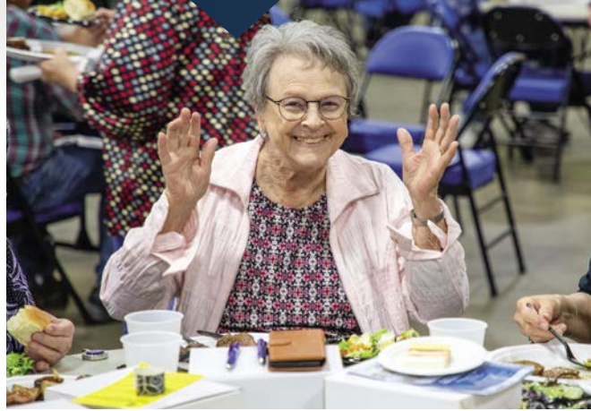
Members enjoyed a hot meal of beef medallions, roasted potatoes and green beans almondine, which was catered by the Baymont Inn and Suites.