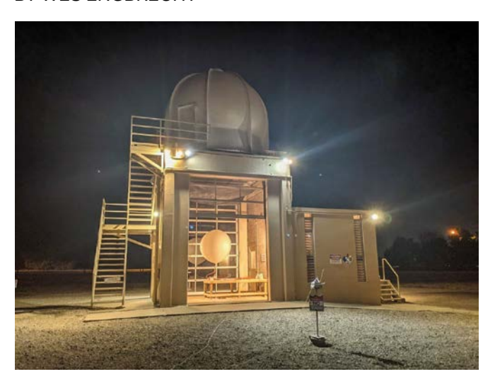
At the upper air inflation building at the National Weather Service in Bismarck, the balloon is inside the building, with the string coming out along the ground to the radiosonde (weather instrument) that is on the post in the foreground.

an you think of a season in North Dakota when the weather doesn't pose a significant threat to people and property? You may wonder whose job it is, other than the National Weather Service, to monitor and notify us, as residents, of those upcoming weather events.