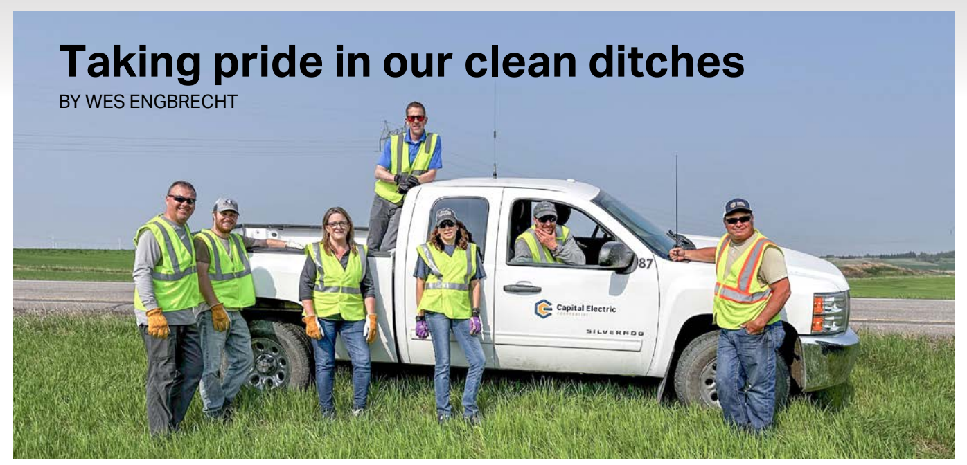
A group of the ditch-cleaning crew assembles by a Capital Electric Cooperative truck as they wrap up the morning's work.

n a busy office north of 71st Avenue in Bismarck, a group of dedicated Capital Electric Cooperative employees put their busy workday on hold to maintain the beauty of a stretch of Highway 83 heading south of their office.