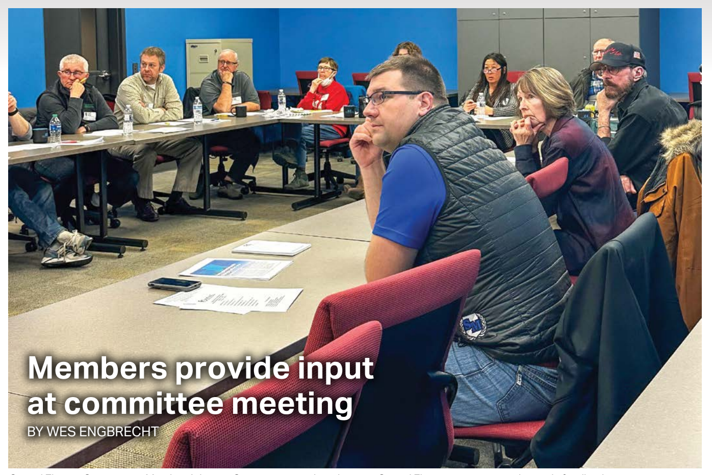
Capital Electric Cooperative Member Advisory Committee members listen to Capital Electric managers and provide feedback on current topics faced by the co-op.

apital Electric Cooperative puts much stock in member feedback. The annual Member Advisory Committee meeting, which is now being held in both March and September, provides an open forum for that feedback. Capital Electric managers provide information on current topics of value, and the committee is encouraged to ask questions and state their opinions.