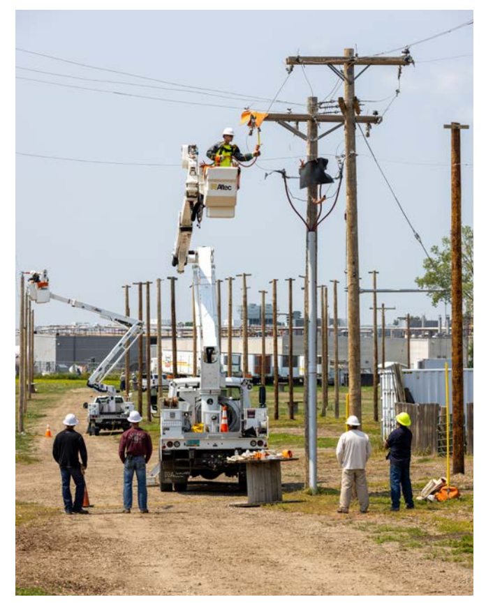
Lineworkers require intentional training to remain safe during line work in all weather conditions.

The next time you spot a Capital Electric line truck, be assured the lineworkers operating that vehicle and other equipment are prepared to do the job safely and efficiently.