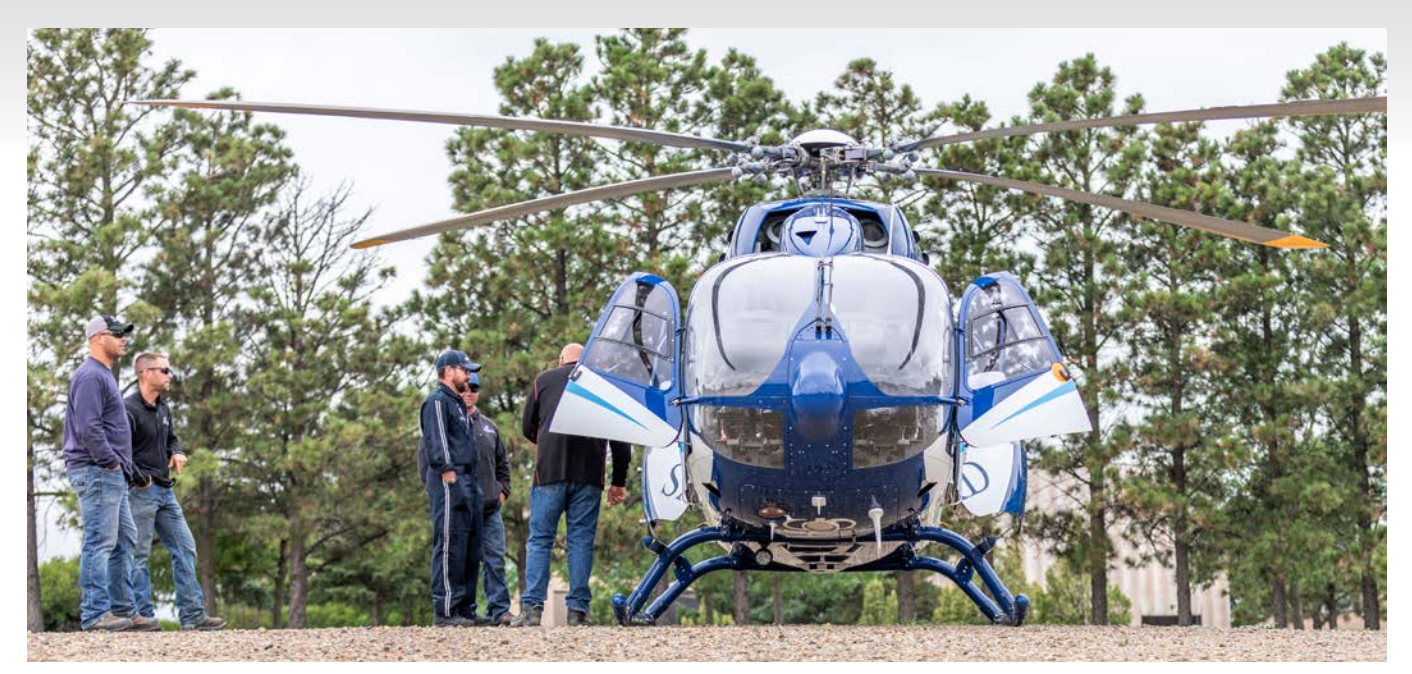
New this year was Medivac training, featuring a helicopter provided by Sanford Health.