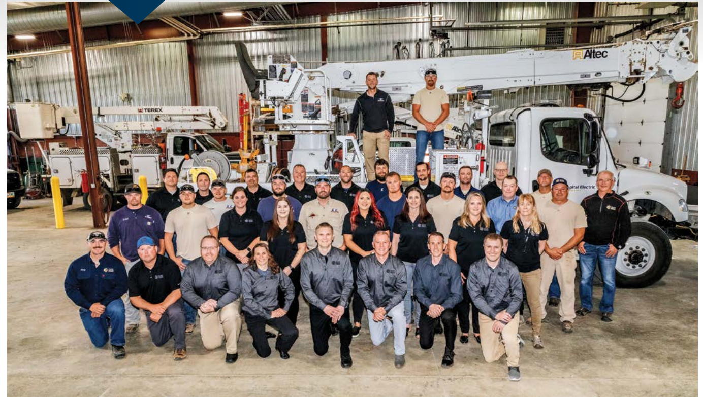
Capital Electric Cooperative employees are happy to represent and serve our membership each day.