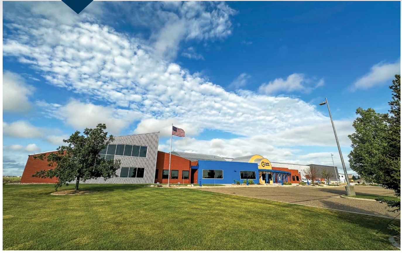
Our new headquarters rests on the prairie north of Bismarck.