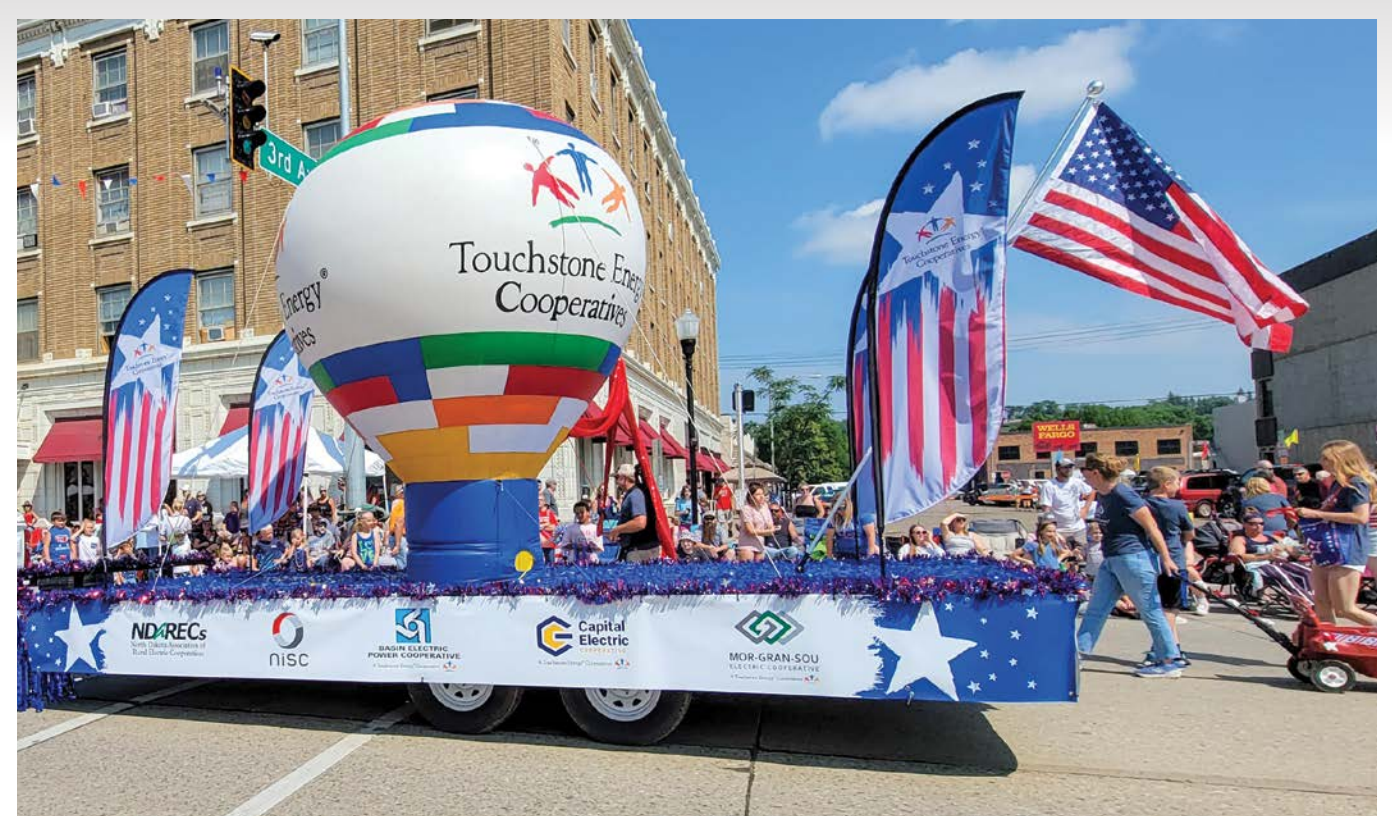
This year's Touchstone Energy float shines bright as it makes its way through the parade route.