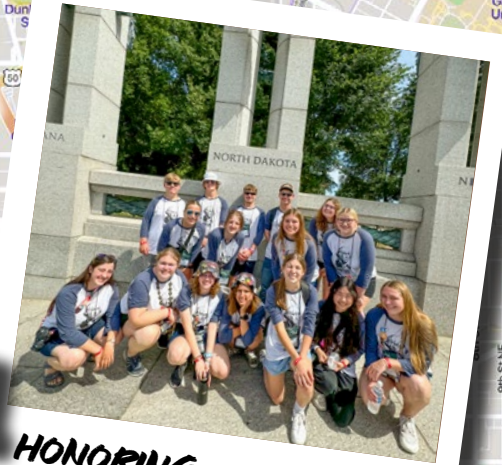
HONORING HEROES @ WWI MEMORIAL