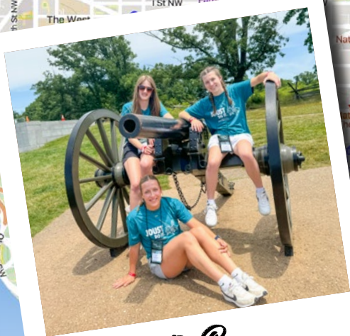
FIRED UP @ GETTYSBURG!