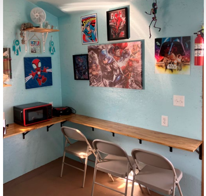
The warming house is a welcome place for a comfortable break from the cold. It's also a perfect place for a birthday party, as it has space for up to 12 kids. It even has a superhero theme!

"At Wing's Snow Sled Park, we provide groomed runs for a great winter sledding experience for all ages and to enjoy the great outdoors during the long winter months in North Dakota. The Wilton Lions Club sponsors all events at the park, so without them it wouldn't have happened," he says.