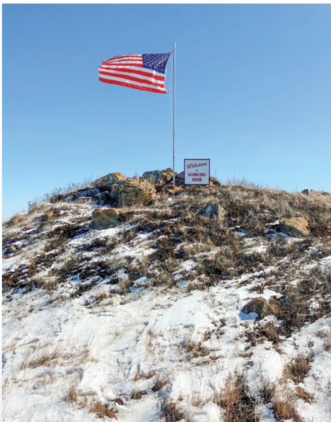
The peak of the sledding hill marks the beginning of a great day of sledding on Gobbler's Knob.

"The sledding area is built on a two-tiered hill. The hill is long, approximately 280 yards, but not too