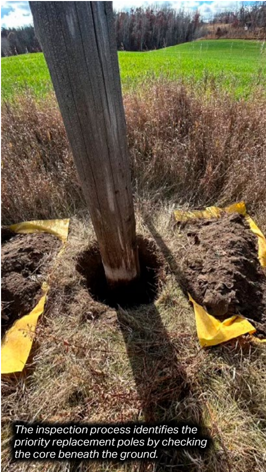
The inspection process identifies the priority replacement poles by checking the core beneath the ground.

A s winter begins to dominate the weather forecast, Capital Electric Cooperative lineworkers hope for the best, but plan for the worst. Over the last two winters, they have seen both. But weather can damage our system during any season.