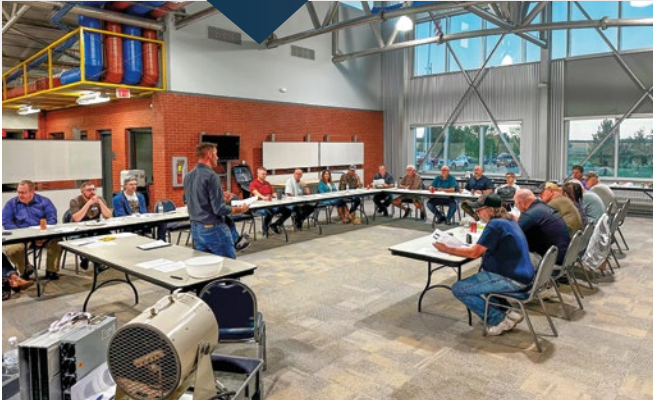
Members showing an interest in the co-op's activities is the purpose of the Member Advisory Committee.