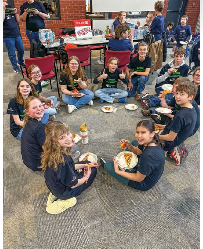
A highlight of the day was sharing pizza with friends between events.

to focus on how to preserve ocean and sea life. The students took this opportunity to share their thoughts on maintaining a healthy Earth for their future.