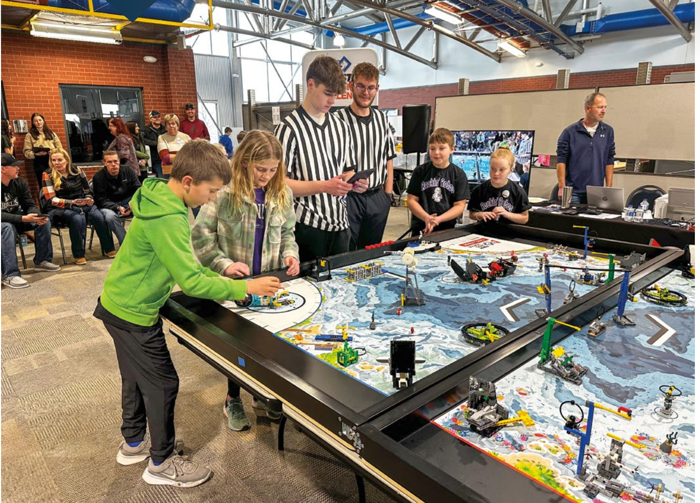
Referees for the event were comprised mostly of former robotics team members who are now in college. Here, they work with the Rockin' Robos to help them with the mission.