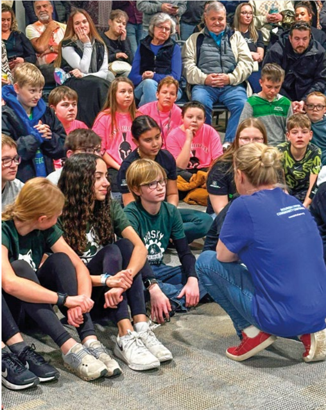
According to this student from Horizon Middle School, being comfortable in front of people and communicating are important benefits of the program.