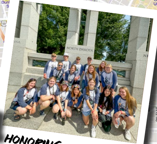
HONORING HEROES @ WWI MEMORIAL