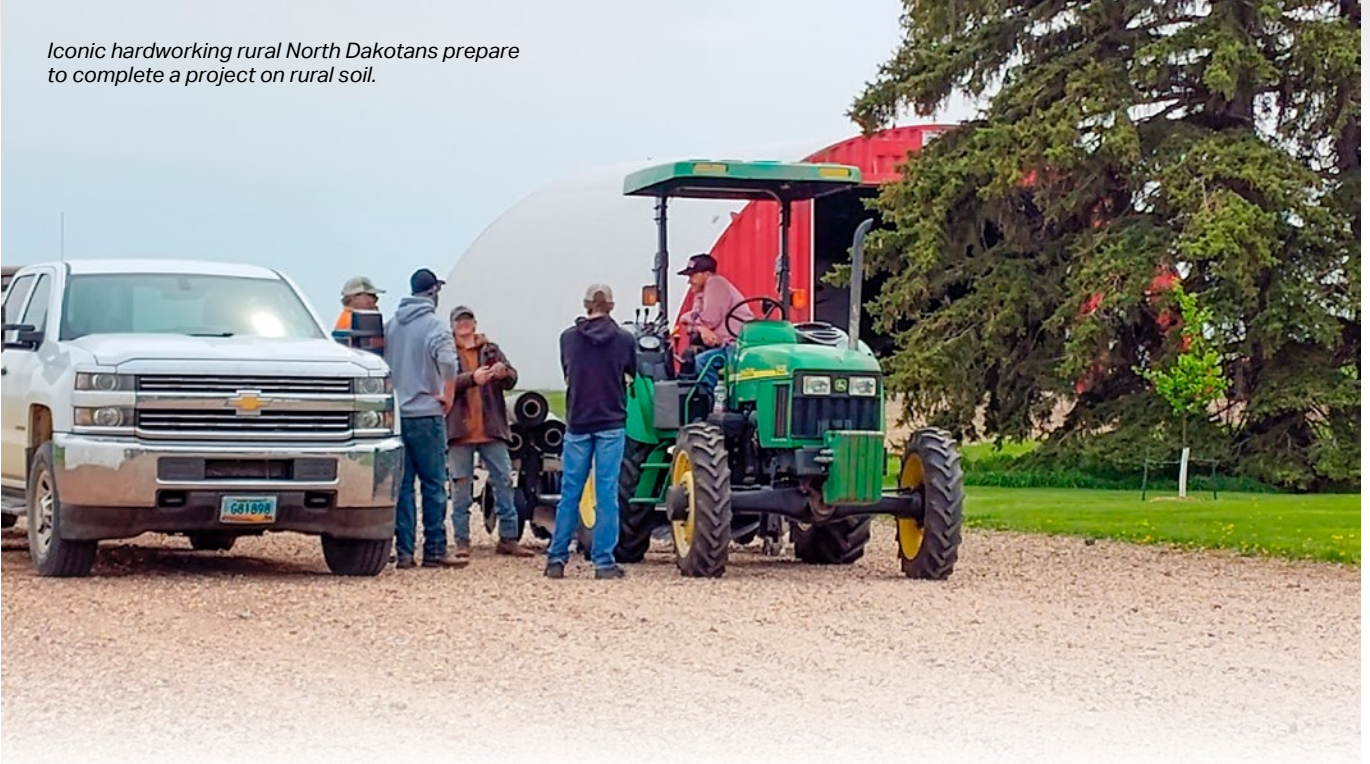
Iconic hardworking rural North Dakotans prepare to complete a project on rural soil.