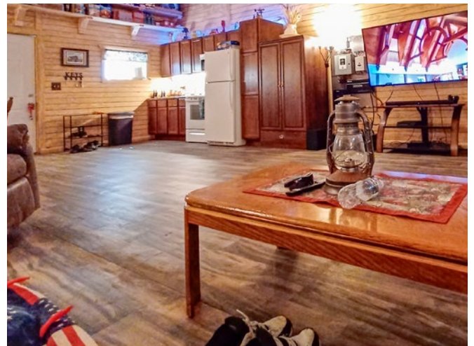
The inside of the cabin is completely furnished and ready to use.