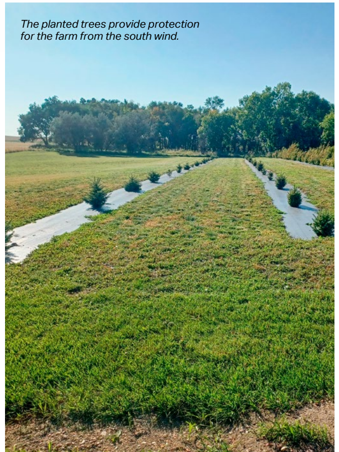
The planted trees provide protection for the farm from the south wind.