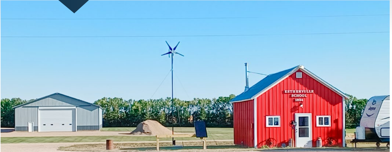
Many hours went into the restoration of the one-room school building, resulting in a beautiful cabin.